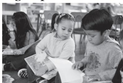
Your contribution makes a difference to someone in our community. Sponsorships or time volunteered, your support is greatly appreciated.