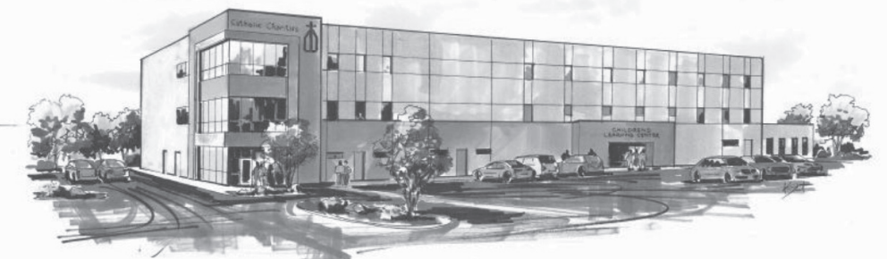
Prayer, Work and Learning at the CCUSA Annual Gathering in Houston

COLLABORATION Partnering with others Seeking others with the abilities to find solutions