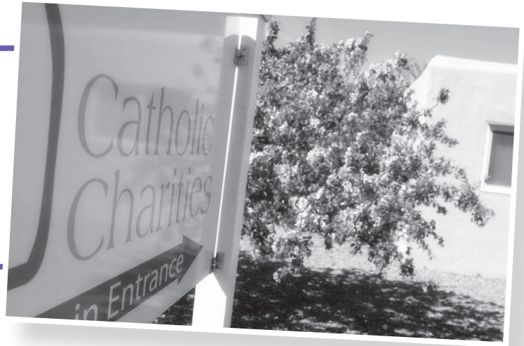
Casa De San Francisco