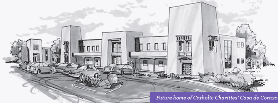
Future home of Catholic Charities' Casa de Corazon